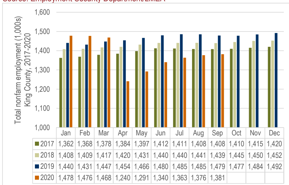
Figure 2. Nonfarm industry employment King County, January 2017 through September 2020

King County job growth was disrupted by the Covid-19 pandemic. The initial shock of job loss was initially met with rapid job recovery, which has been slowing in recent months.