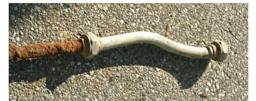
Lead gooseneck service line replacement