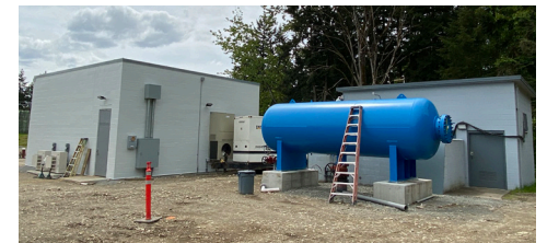
New Academy Pump Station